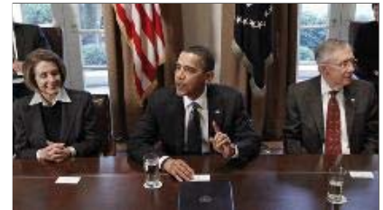
CAPTION By J. Scott Applewhite, AP

Next Obama not done with fallout from Christmas bomb plot